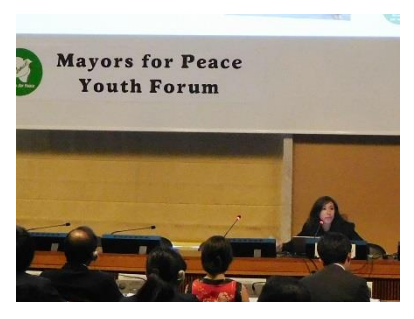
Presentation by a youth from a member city at the Mayors for Peace Youth Forum held in UNOG (April 2018, Geneva)