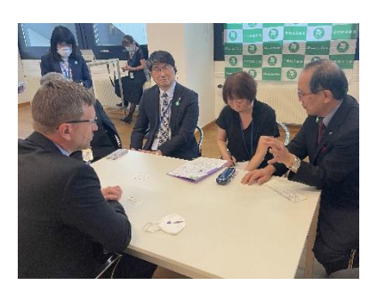
Meeting with national government representatives (June 2022, Vienna)