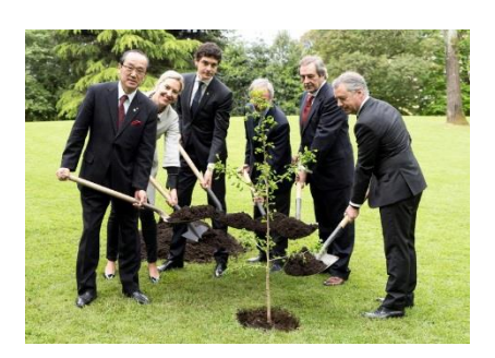
Planting ceremony of a second generation atomic-bombed Ginkgo seedling by a member city (April 2018, Guernika-Lumo)