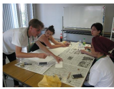
Discussions at the Mayors for Peace Youth Exchange for Peace: Support Program for "HIROSHIMA and PEACE" by youths from member cities (August 2019, Hiroshima)