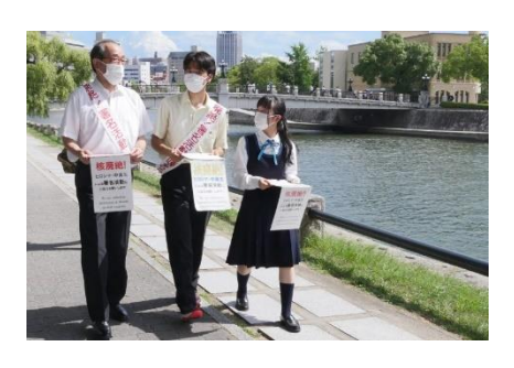
Petition Drive by the President and high school students in the street (August 2022, Hiroshima)