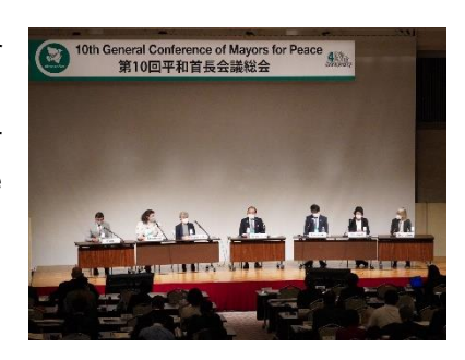
10th General Conference (October 2022, Hiroshima)

Mayors for Peace holds an Executive Conference generally once every two years in one of the executive cities, where executives discuss future initiatives and plans for the next General Conference.